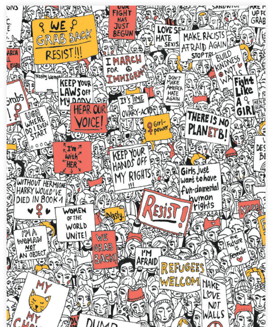
Jolanda Olivia Zürcher Resist! , digitally altered felt-tip drawing. Tübingen, Germany.