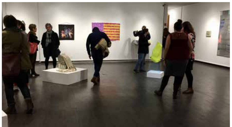
Future Tense II, opening during the Midwest Fiber Art Educators’ Meeting, November 2018