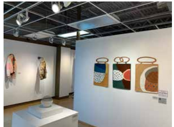
Installation view of Future Tense 2019.

Awarded to various state and regional SDA groups or others who stage events in the field of fiber and textiles.