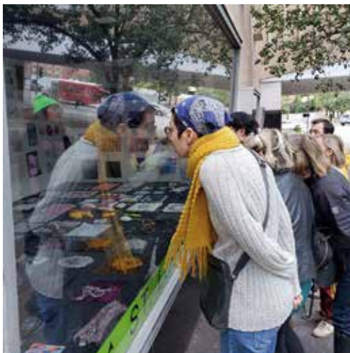
Connections: To and From, St Louis Artists' Guild